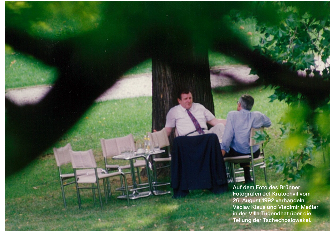
Auf dem Foto des Brünner Fotografen Jef Kratochvíl vom 26. August 1992 verhandeln Václav Klaus und Vladimír Mečiar in der Villa Tugendhat über die Teilung der Tschechoslowakei.

was built between 1929 and 1930 for Greta and Fritz Tugendhat, based on a design by the German architect Ludwig Mies van der Rohe. The uniqueness of this Brno villa lies in its formal architectural purity, its setting in a natural environment and the intermingling of spaces but also in its technical and structural design and the use of noble materials. Villa Tugendhat is not only an iconic building in the context of Brno's modern architecture, but also the architect's magnum opus. That is why, in 2001, it became the only example of modern architecture in the Czech Republic to be inscribed on the UNESCO World Heritage List. Between 2010 and 2012, Villa Tugendhat underwent a restoration returning it to its original appearance at the time of its completion in 1930, including the garden.